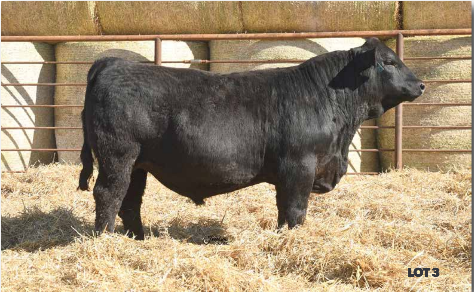
LOTS 2-9: All high-performance Beast Mode sons that should work for anyone!