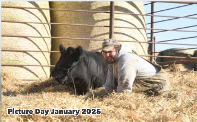
Picture Day January 2025